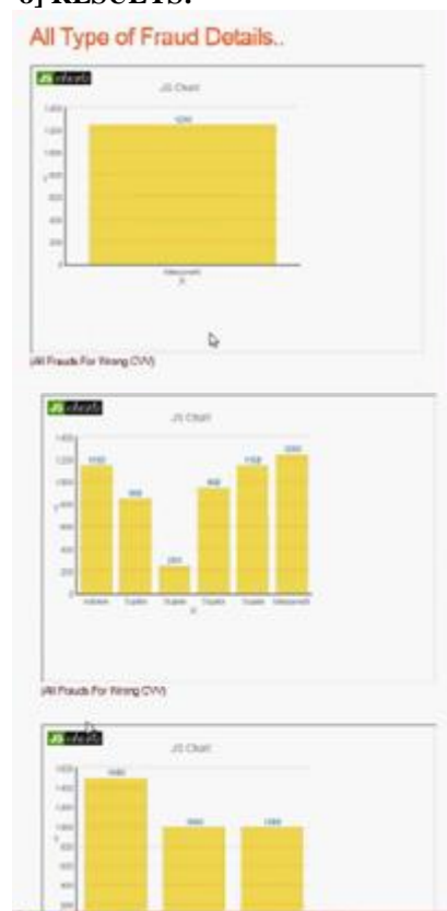
All types of fraud details