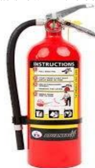
Figure Fire extinguisher PROPOSED SYSTEM

of the passenger has to be stop the fire by using fire extinguisher as shown in the below figure