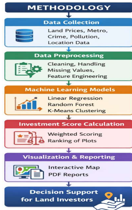
Fig.1 Methodology Diagram