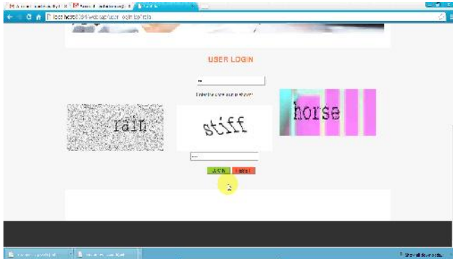
FIG: USER LOGIN (enter password & captcha code):