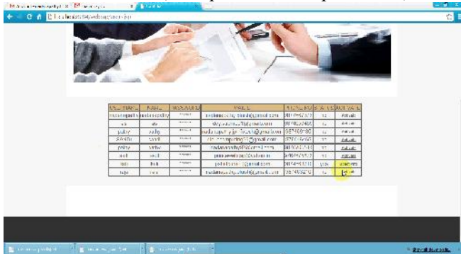
FIG: Admin activating blocked user