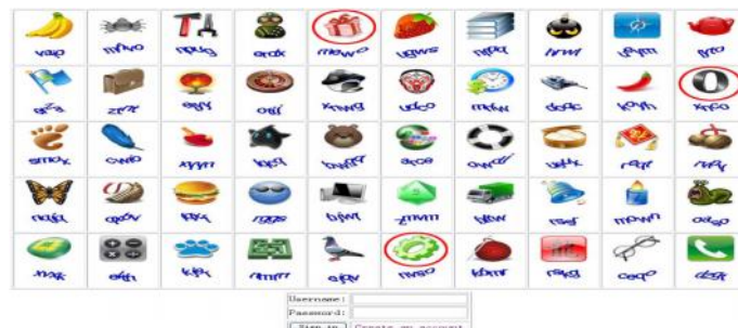
Figure 1. The interface of the basic scheme (The pass-images are circled).

CAPTCHA to graphical passwords to create a highly secure authentication method.