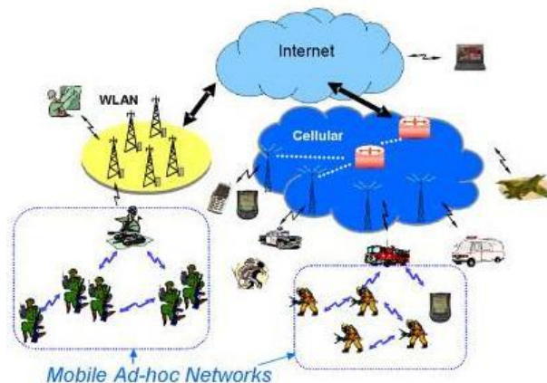
Figure 1: Wireless Sensor Networkd with data transmission.

the structure. Consequently, any affected locations under a foe's management could carry about large injury to the performance and protection of its structure since the effect would appropriate in performing redirecting tasks.