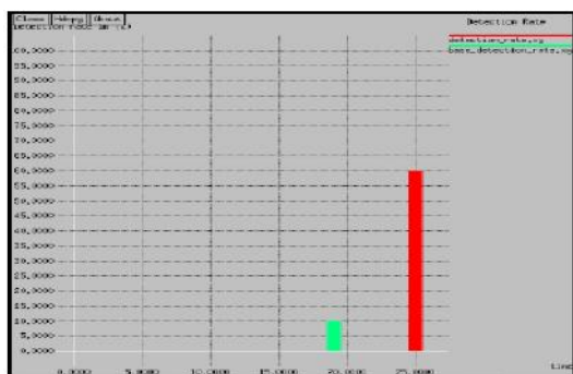
Figure 5: Detection rate in Forgeries in WSNs.