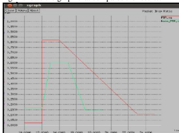
Figure 4: Packet delivery ratio in WSNs with comparison of AODV and DSR.

Fig. 4 shows the graph that compares the results.